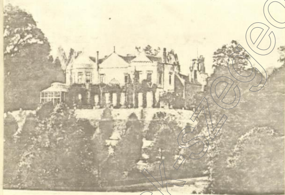
Sandford Orleigh, illustrated in 1895