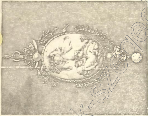
The locket sent by the Empress Eugénie to Lady Baker at Khartoum. The locket survived the journey from Masindi and remains a treasured possession of the Basmendi family.