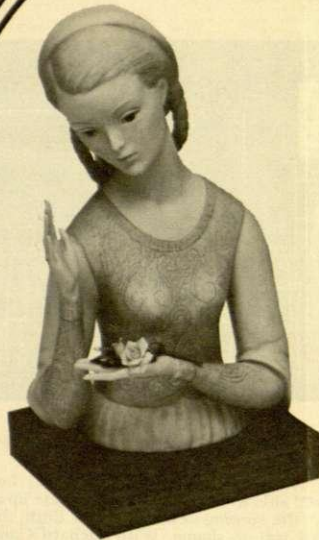
"Promises" Limited Edition of 100 Price $2,500.00

We at Armstrong's have the largest selection of Ispanky porcelains in the world. Among them are two other limited editions which we believe have the potential to do well from an investment standpoint. They are an exceptionally good value at the present because they are both available at the original price and both editions are very near completion. They are "David" and "Jessamy". "David" is a limited edition of 400 pieces and is $450.00. "Jessamy" is also a limited edition of 400 pieces at $450.00. Armstrong's deliver anywhere within the United States and your inquiries are invited.