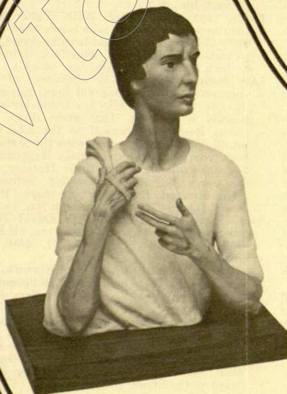
"David" Limited Edition of 400 Price $450.00