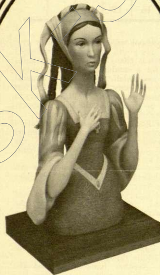
"Jessamy" Limited Edition of 400 Price $450.00