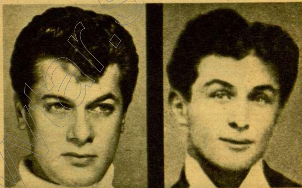
HOUDINI & DOUBLE: Actor Tony Curtis (left) bears a startling resemblance to Houdini when he was young (right).

● Dunninger expects to coach Tony Curtis, who'll play Houdini in the picture. But he'll leave the dangerous stunts to doubles. "After all," he says, "the public won't expect this youngster to dive off bridges, handcuffed like Houdini, or be lowered in an iron box into a river!"