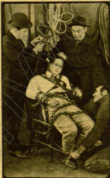
HOUDINI IN CHAINS: This is how Houdini was chained in old movie, "Terror Island." He quickly set himself free.

... for anyone who can talk with this lonely ghost