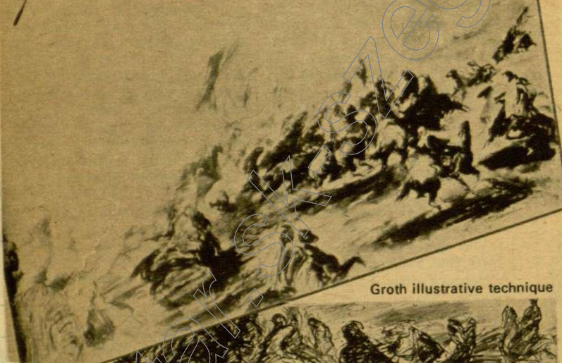
Groth illustrative technique